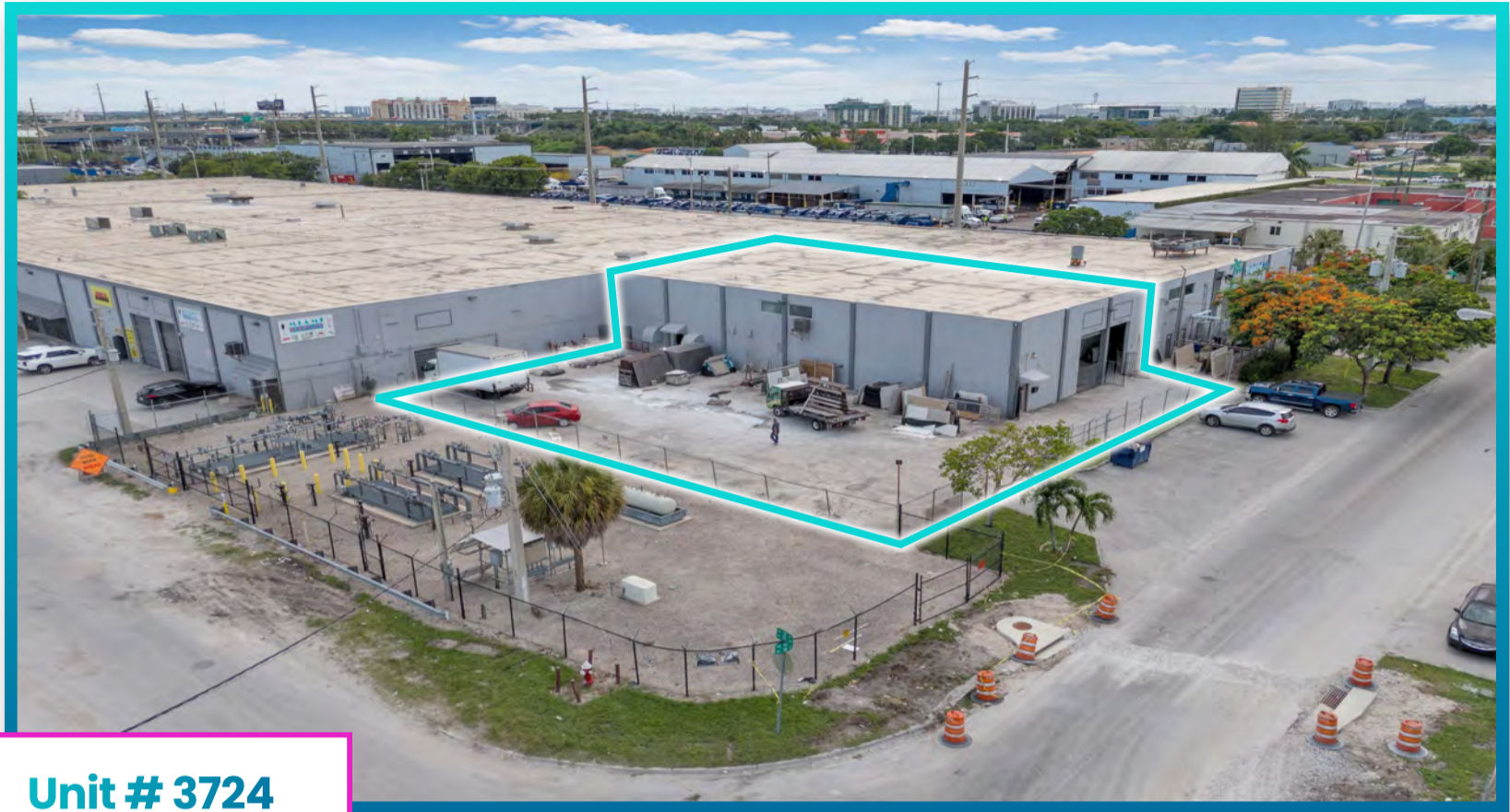
Unit # 3724